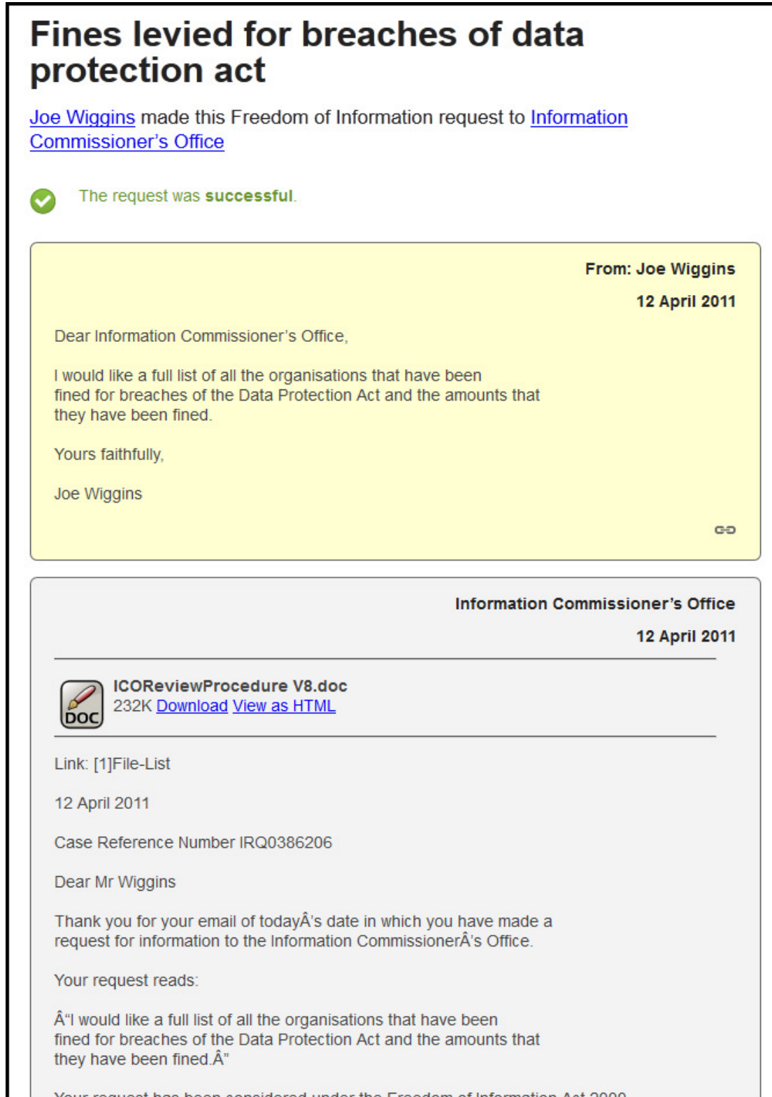
Figure 6: A page containing a response from the government

The user is then presented with a web page on WhatDoTheyKnow that contains a request about fines made by a user, and a series of subsequent replies sent by the government body.